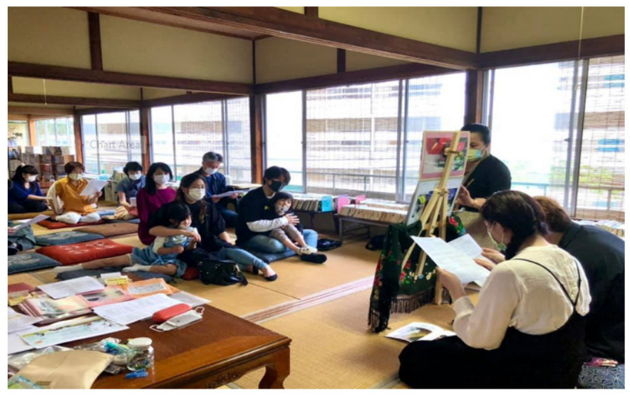
Figure 5. Storybooks reading participants at the Hon [Book] café Shinobuyama