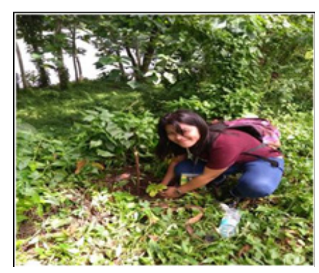
Figure 4. Tree Planting Activities