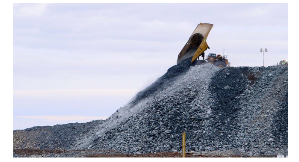
Figure 2. Mine wastes are technospheric stocks and can be utilized for metal or mineral resource recovery as part of technospheric mining

converted to useful products or prior to valuable metal extraction. Some are regulated by legislations for waste management practices and these could vary between countries as well. The technologies required for technospheric mining also vary depending on waste types and the target material for recovery. There are existing technologies that are readily transferrable to technospheric mining, such as technologies applied for mineral processing and extractive metallurgy, but these require proper assessment on amenability and suitability. The technology readiness levels (TRLs), applied by scientists, engineers, and policy makers to evaluate the maturity of a particular process or technology, are also variable ranging from laboratory scale to commercialization levels. The development of technology tailored for a specific waste or waste repository is highly important. But of course, technospheric mining is not only about technology and scientific innovations. As with the general concept of a circular economy, the involvement of the different sectors of the society is imperative.