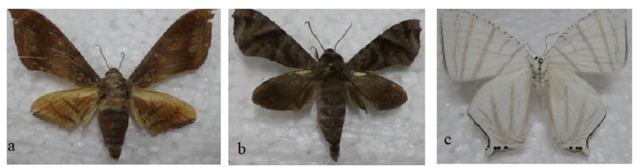
Plate 7. Family Uraniidae: Ourapteryx (a), Lyssa sp. 1 (b) and Urapteroides sp. 1 (c).