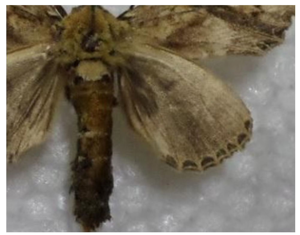
Plate 11. Family Notodontidae: Dudusa (a)