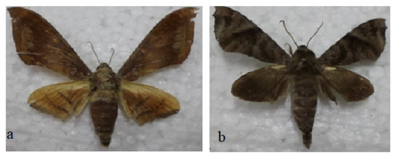
Plate 6. Family Spingidae: Ambulyx sp. 1 (a) and Ascomeryx sp. 2 (b).