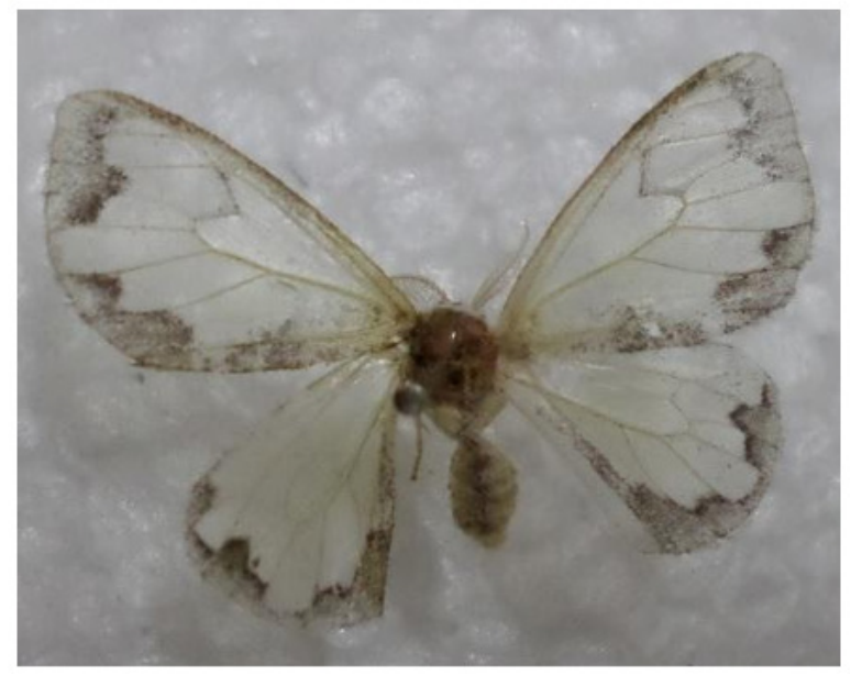
Plate 5. Family Sesiidae: Sesiidae sp. 1