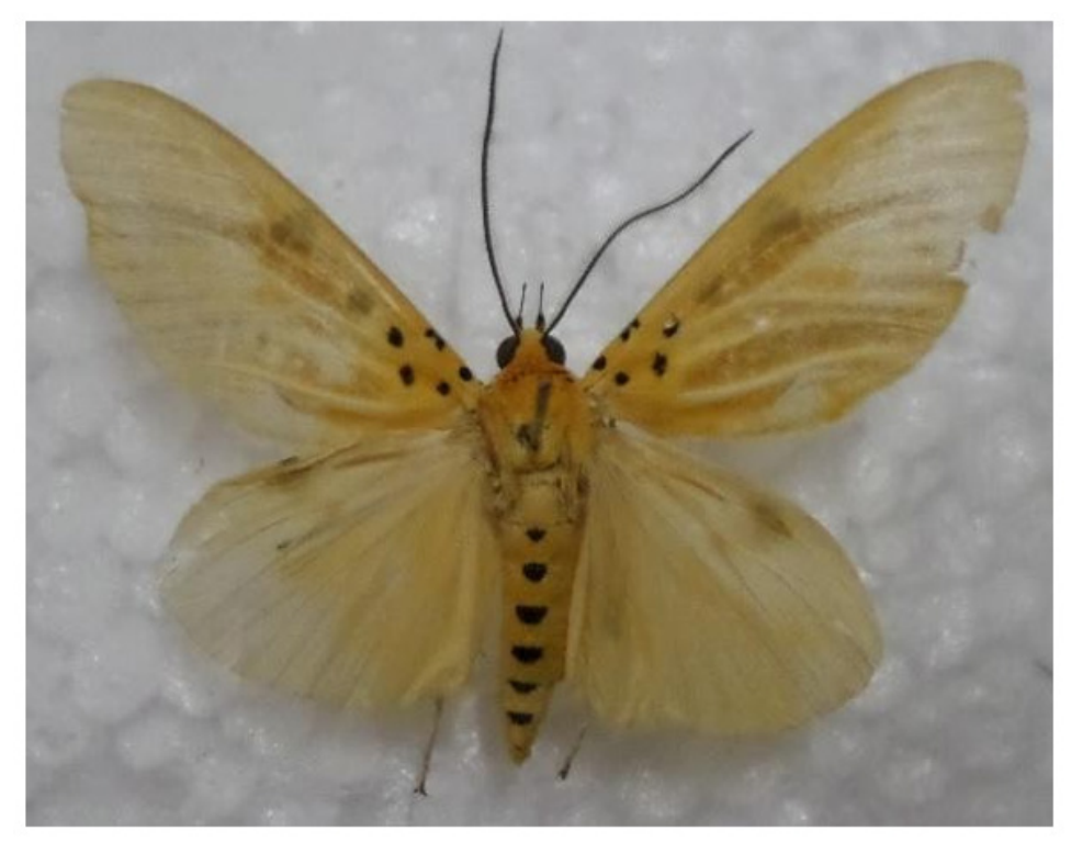
Plate 10. Subfamily Aganinae: Asota (a)