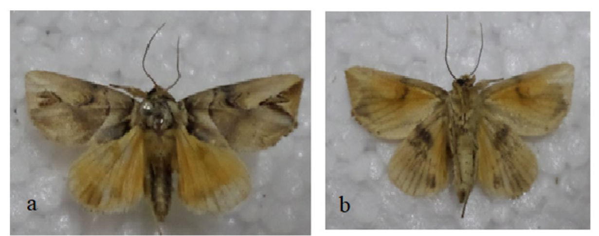
Plate 8. Family Xylorictidae: Crypthopasha russata, dorsal (a) and ventral (b) view.