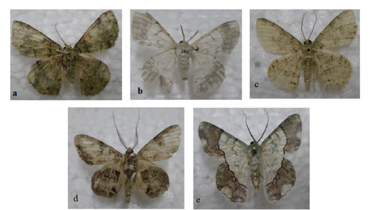
Plate 1. Family Geometridae: Gastrina cristaria (a), Pingasa chlora (b), Taxeotis sp.1 (c), Hypomecis (d) and Pingasa ruginaria (e).