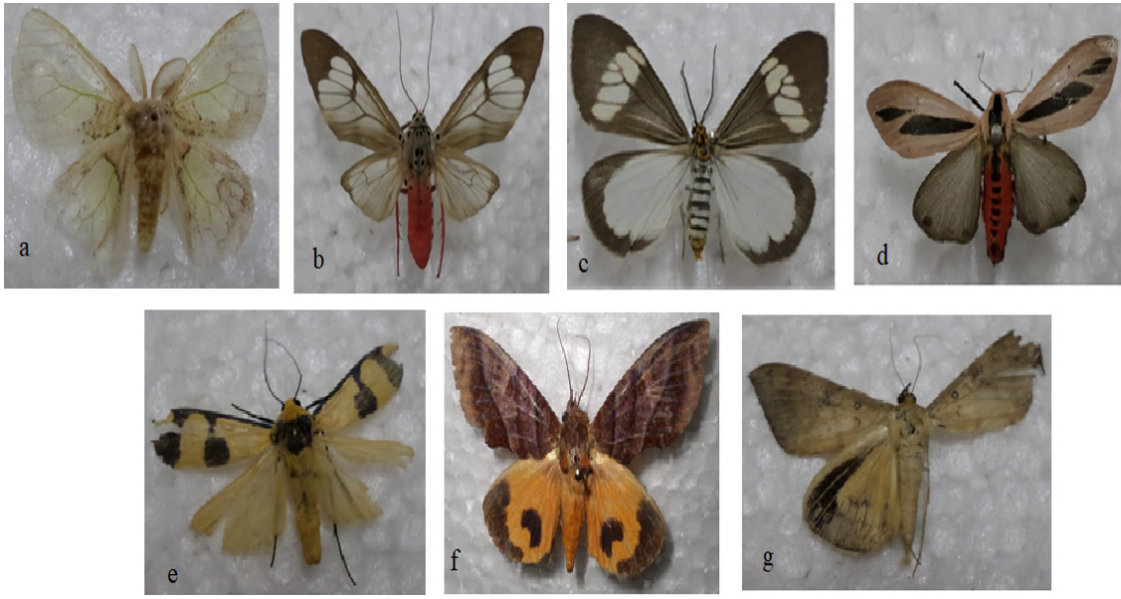
Plate 3. Family Erebidae: Carriola ecnomoda (a) , Amerila (b), Nyctemera baulus (c) Creatonotos gangis (d) Oenistis altica (e), Eudocima sp 1(f), Oxyodes scrobiculata (g)