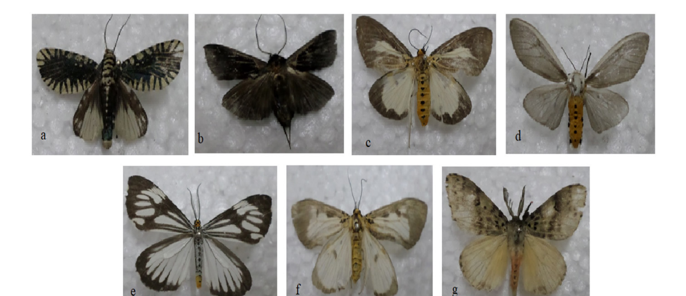
Plate 9. Family Noctuidae: Apsarasa radians (a), Persectania dyscrita (b), Noctuidae sp. 1(c), Noctuidae sp. 2 (d) Noctuidae sp. 3 (e), Noctuidae sp. 4 (f), Noctuidae sp. 5 (g)