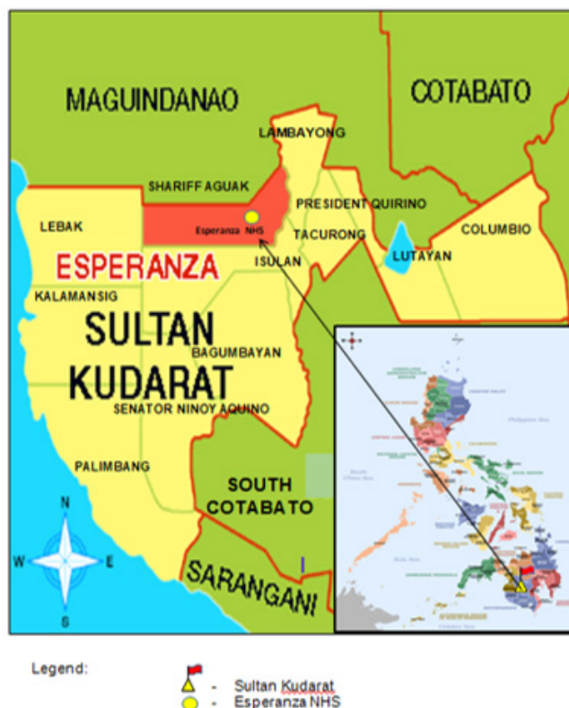
Figure 2 Geographical Map of the Research Locale

development stage. These three stages permit the researcher to plan, develop, and revise the developed lesson based on insinuated experts. The first stage (pre-development) includes needs analysis, identifying objectives of the lesson, planning for the content, and TAM (Task Analysis Matrix) preparation. The researcher developed and prepared the Task Analysis Matrix as a guide for organizing the lesson. TAM aided the researcher in identifying the skills to be improved, instructional objectives to attain, and allocation of the number of days in covering the lessons.