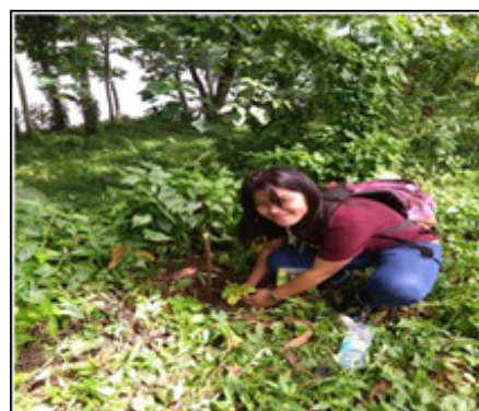
Figure 4. Tree Planting Activities